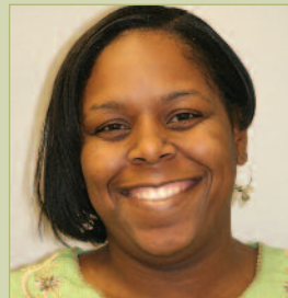
Quateka Hill, LPN NURSING COORDINATOR